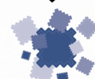
Shredded up and broken down