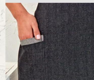
Slanted side pockets with contrast trim