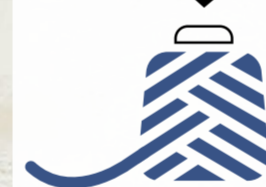
Spun back into yarns