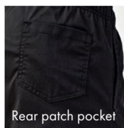
Rear patch pocket